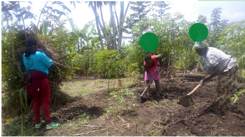
Surveying subjective resilience of farmers in the Fort Portal area, Uganda.

This initiative may also demonstrate the need for a cross-sectoral approach to the Sustainable Development Agenda, open up more partnership and funding opportunities,