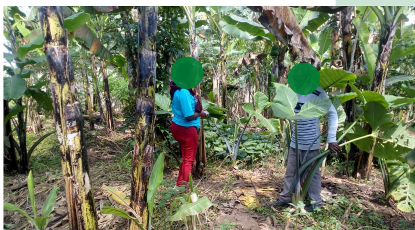
Surveying subjective resilience of farmers in the Fort Portal area, Uganda.

WASTE can show its commitment to making farmers more resilient to climate change by implementing the suggested three entry points outlined below. These entry points are suggested based on the research findings and create an all-in approach via which WASTE can validate its potential of creating more climate change resilience amongst the farmers in Fort Portal as part of their holistic approach to strengthening the local circular sanitation economy.