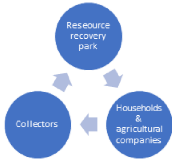
Simplified circular economy model

In this context resilience is defined as the capacity to absorb extreme events, adapt to hazards and transform to a less vulnerable life, in particular affecting the Ugandan communities' main livelihood source, agriculture.